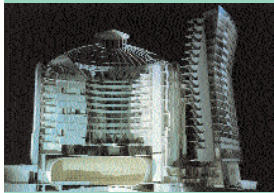
Gasometer B, model (Coop Himmelbl(l)au)