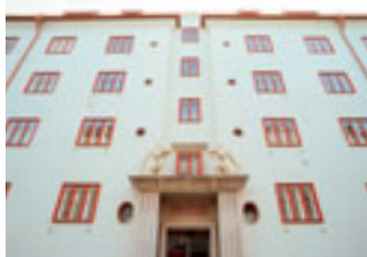
Liesing Hof Council Housing Estate (Josef Hoffmann, 1924-25)