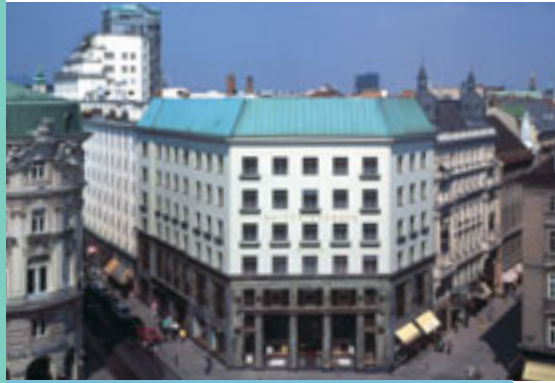
Loos Building (Josef Loos, 1910-11)