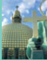
Goswami Church (Erich Wagner, 1919-21)